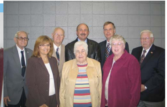
Central Electric Cooperative's Board of Directors