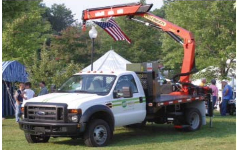
CEC's new truck on display.

Annual Meeting. A Time for Family, Friends, Fun, and Entertainment. Hope to see you next year!