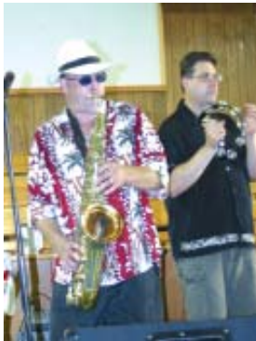
Smokin' Section performs..