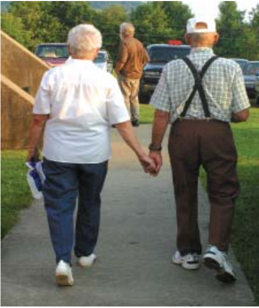
A walk together.