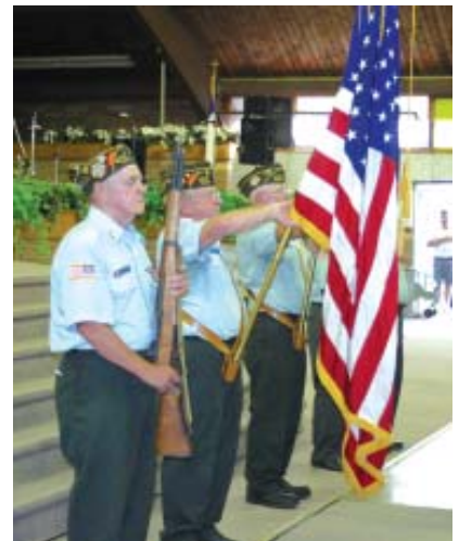
Parker VFW Post 7073 presented the colors to open the meeting.