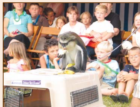
Lucy, who is part of the Wild World of Animals, put on quite a show during children’s entertainment.