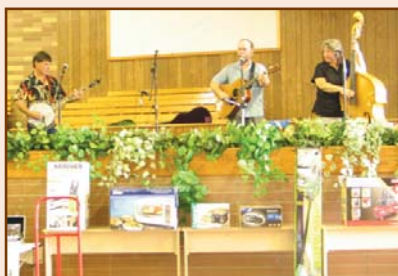
The Allegheny Drifters prepare for their performance.