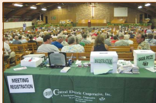
Members wait for the business part of the meeting to begin.