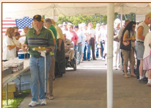
Members eagerly await their turn in line for a delicious KFC chicken dinner.