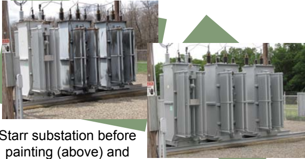
Starr substation before painting (above) and after (right)

voltage is stepped down to lower voltage that is carried on our lines to members' homes, farms and businesses. Keeping the large transformers in these substations in good working order is crucial to keeping the lights on for members. Substation transformers work 24 hours a day, 365 days a year, so we must protect them from the elements.