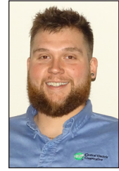
Manager of Safety & Loss Control

Don't be a stranger, to electrical danger.