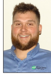
Manager of Safety & Loss Control