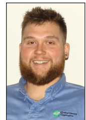
Manager of Safety & Loss Control

As we enjoy the beautiful summertime weather, we need to keep in mind that overexposure to the sun can lead to a variety of health risks.